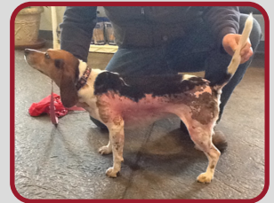
After 3 months of treatment