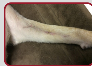
1 month post treatment